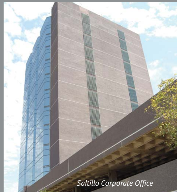
Saltillo Corporate Office

proximity to major domestic and international markets, along with easy access to ground and air transportation. The availability of a qualified labor force in addition to vocational institutions and quality of life are also important features we address when considering a new project for a client. Amistad works with each client to create the ideal balance by offering a full range of services: world class industrial parks, site selection, green-site acquisition and development.