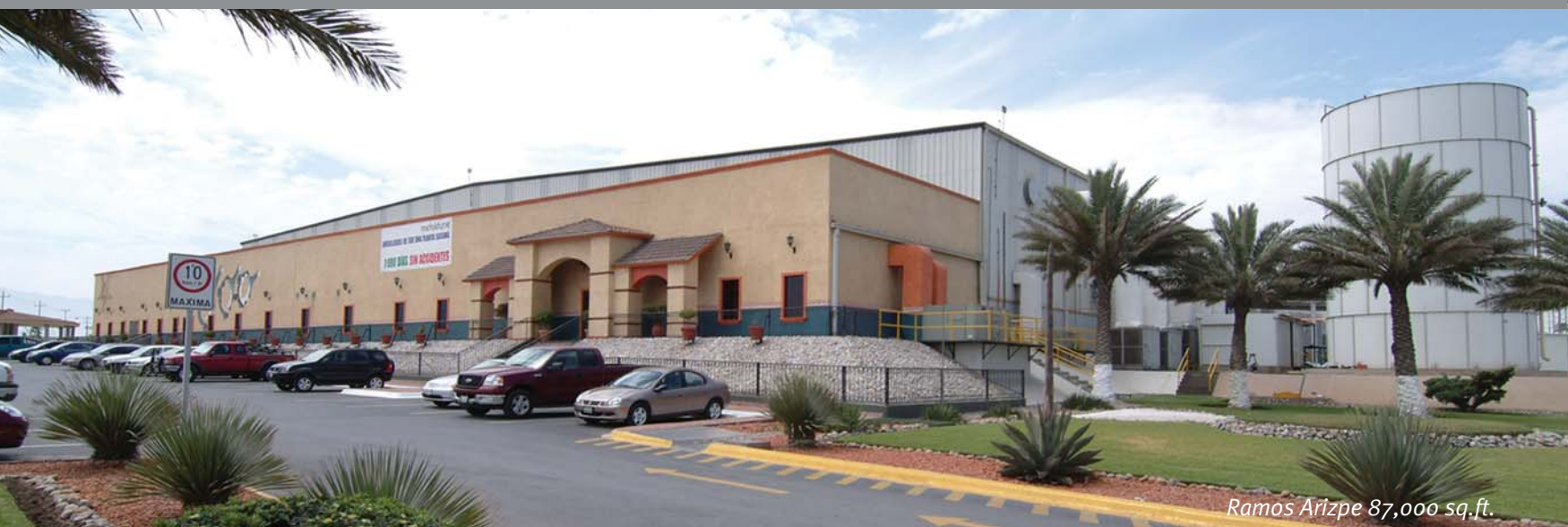
Ramos Arizpe 87,000 sq.ft.