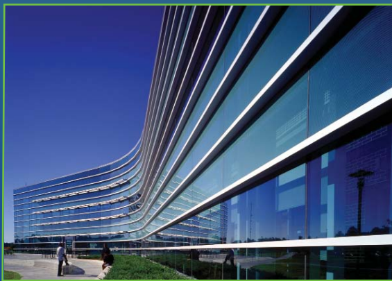
Chesapeake College Learning Resource Center, Wye Mills, MD. A satellite site of Chesapeake College is located in Cambridge, MD.

Visit Dorchester County and discover why it is a great place to live, work, play and do business!