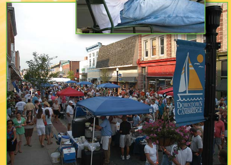
Annual Taste of Cambridge event, downtown Cambridge, MD.