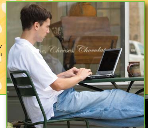
Wireless capability in downtown Cambridge, MD.