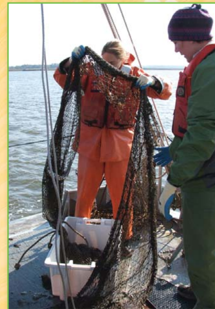
University of Maryland Center for Environmental Sciences, Horn Point Laboratory, Cambridge, MD.

The Cambridge-Dorchester Regional Airport is conveniently located adjacent to the Business and Technology Park. A planned expansion of the airport will extend the runway from 4,476 feet to 5,400 feet to allow for larger aircraft service. Since the airport is out of the restricted zone, takeoffs and landings involve little or no delays.