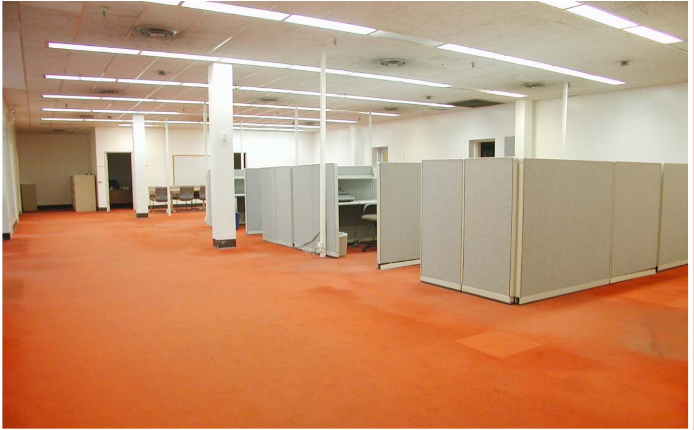
TYPICAL OFFICE AREA