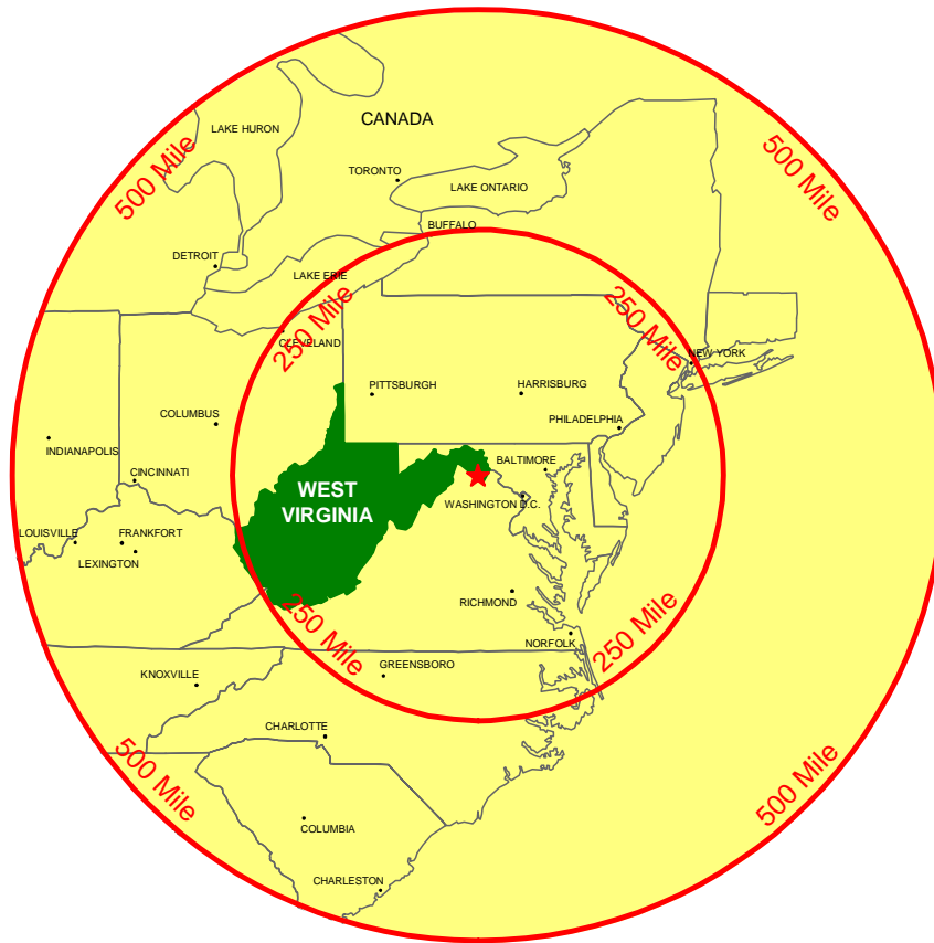
250 & 500 MILE RADIUS FROM MIDDLEWAY, WEST VIRGINIA