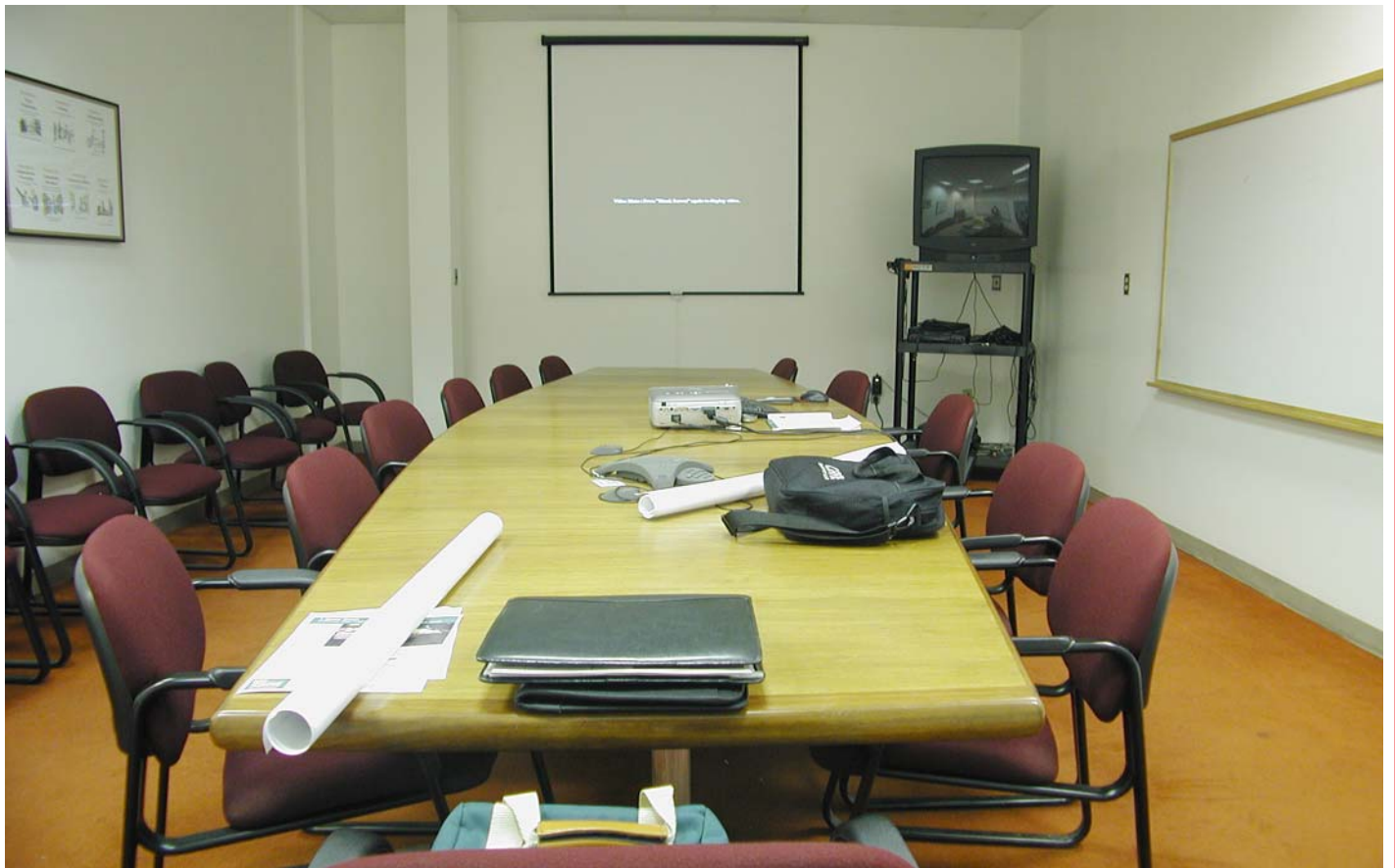
1ST FLOOR CONFERENCE ROOM