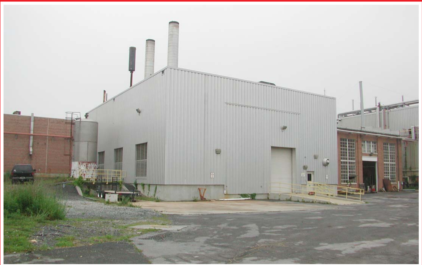
BOILER ROOM (1992 ADDITION)