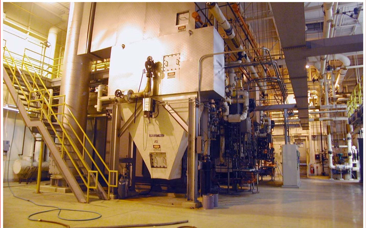
BOILER ROOM SHOWING NEBRASKA BOILERS