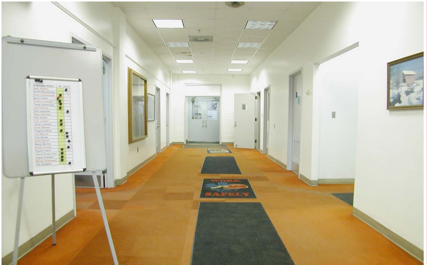
1ST FLOOR OFFICE SPACE CORRIDOR