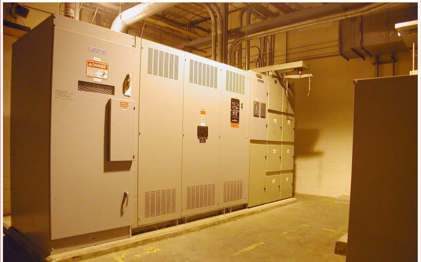
ELECTRICAL SUBSTATION ROOM