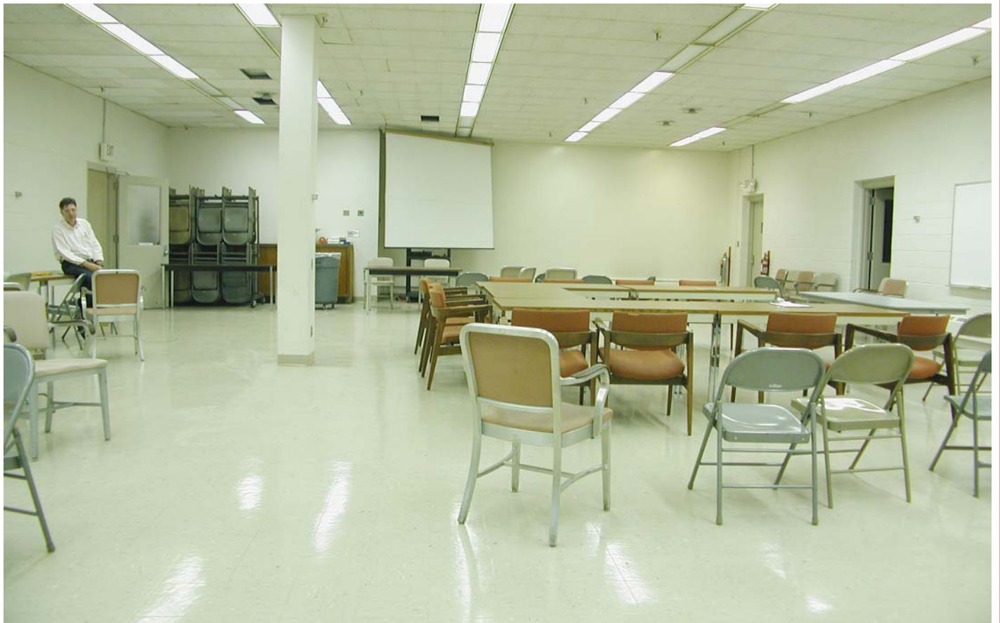
2ND FLOOR CONFERENCE ROOM