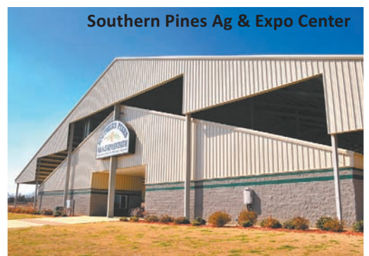
Southern Pines Ag & Expo Center