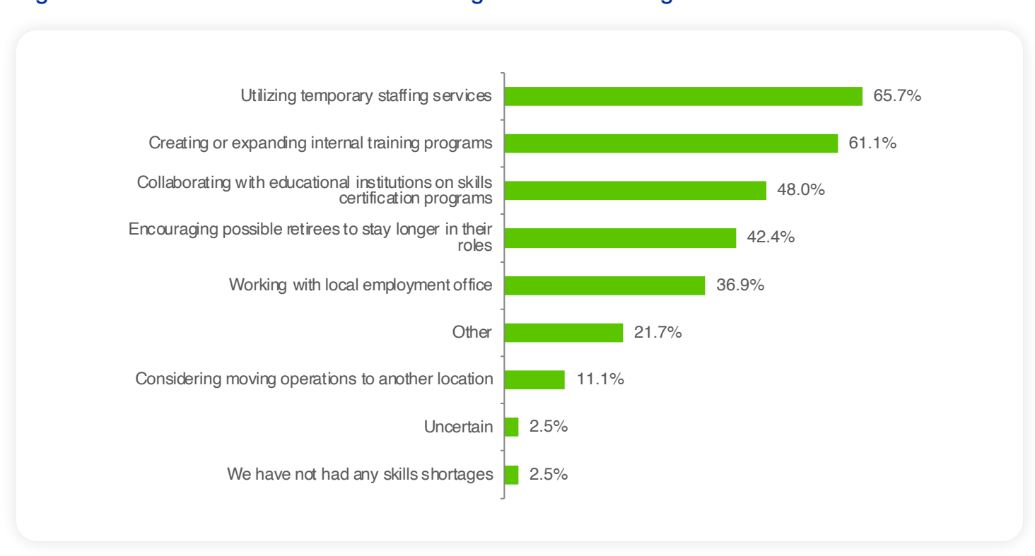
Figure 1: How Manufacturers Are Addressing the Skills Shortage

Nearly 66% of manufacturers were responding to the workforce shortage by utilizing temporary staffing services more (Figure 1), but internal training programs were also an important solution, with 61.1% saying that they had created or expanded such programs at their company. Other important ways of addressing the skills shortfall included collaborating with educational institutions on skills certification programs (48.0%), encouraging possible retirees to stay in their roles longer (42.4%) and working with the local employment office (36.9%). Various forms of compensation, including raises, benefits and referral/signing bonuses, were the bulk of the responses for those marking "Other" (21.7%), but there were also mentions about marketing the positions differently, hiring individuals with prior convictions and altering shifts or the workweek to create more flexibility.