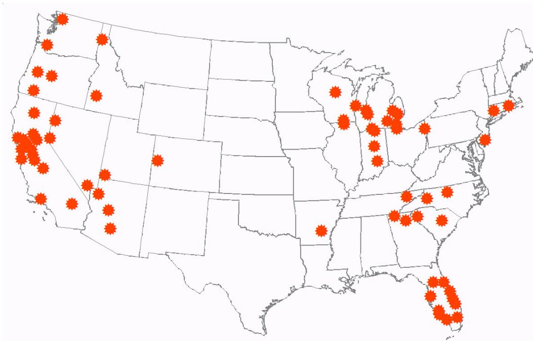
Metros with Current Employment More Than 10 Percent below their Five-Year Peaks