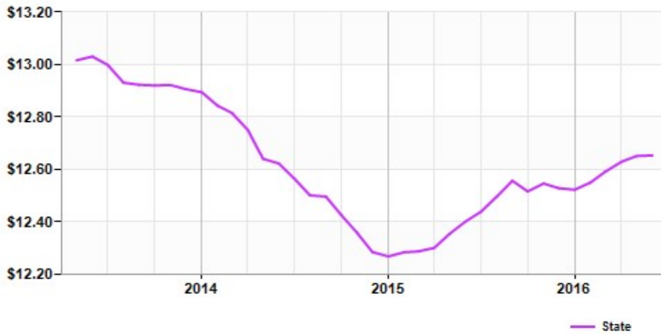
Asking Rent Retail for Lease Fort Valley, GA ($/SF/Year)