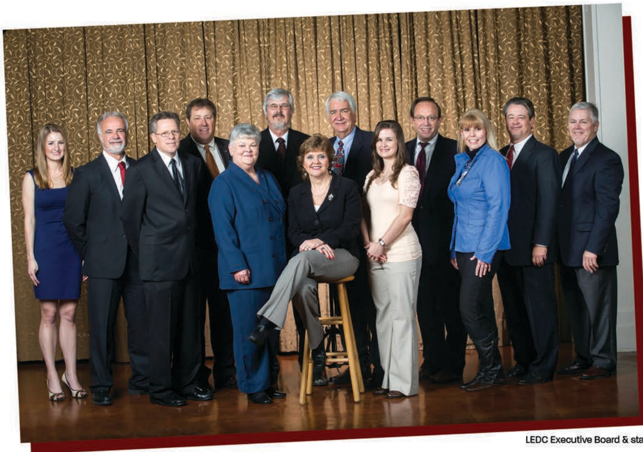
LEDC Executive Board & staff

This annual report is all about THEBIGPICTURE in Livingston Parish. And that big picture is this: This community is coming into its own, fast emerging as a hub for manufacturing, health care and retail, evidenced by the number of major new locations in 2012.