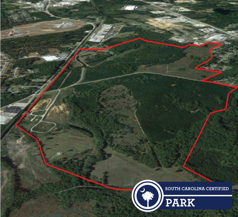
Greenwood East Rail Park - 512 Acres Largest SC Certified rail-served industrial park in 10-county Upstate region