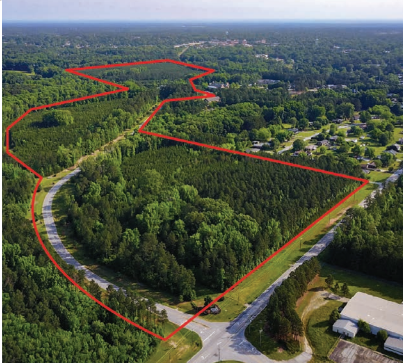
Greenwood Research Park - 192 Acres 1 of 3 private research parks in SC w/ fiber optic backbone network service