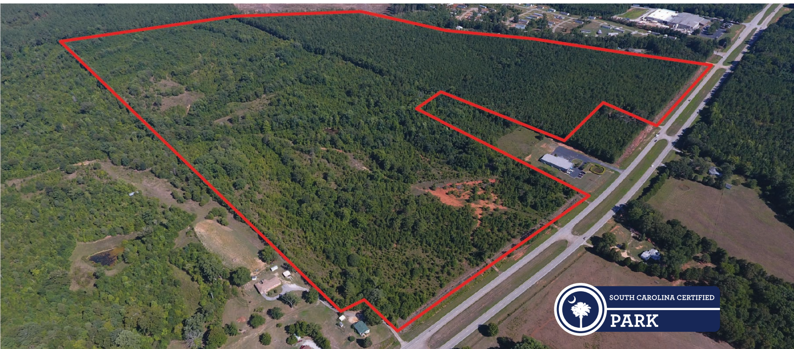
Greenwood County North Industrial Park - 141 Acres SC Certified publicly owned within 35 minutes to Interstate I-385