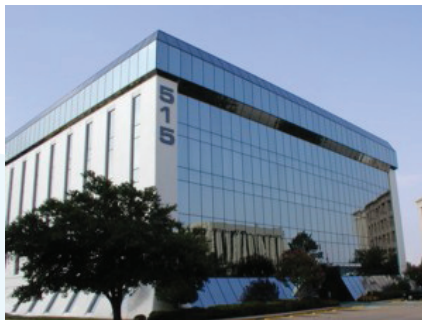
515 Greens Road

QuEST Global Services , a global engineering services provider, leased 7,674 square feet of space at 515 North Sam Houston Parkway E. The company, which already has more than 100 employees in the Houston area, plans to hire between 300 and 400 more to meet the rising demand for engineering services in the oil and gas industry.