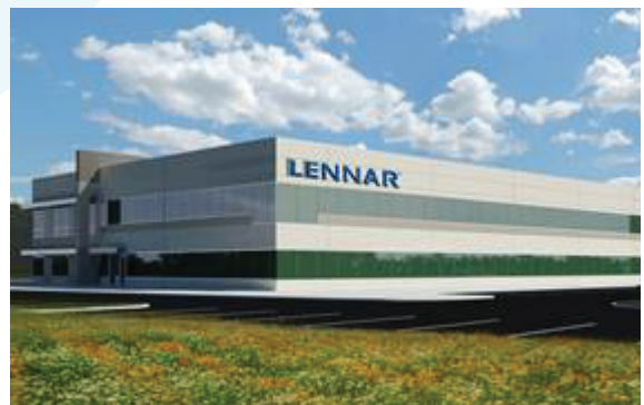
681 Greens Parkway

Lennar Homes of Texas Land and Construction will relocate to a new 68,980-square-foot facility at 681 Greens Parkway. Completion of the facility is planned for October 2015.