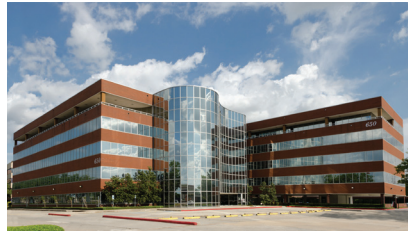
650 North Sam Houston Parkway E

R.K. Phillips & Associates, LLC has leased 2,299 square feet at 650 North Sam Houston Parkway E.