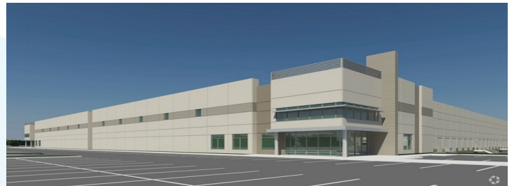
600 Fallbrook Drive

Fallbrook 1, a 500,400-square-foot industrial facility is being developed at 600 Fallbrook Drive.