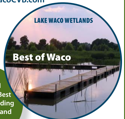
LAKE WACO WETLANDS

WACOAN magazine's Best of 2010, including restaurants, and venues