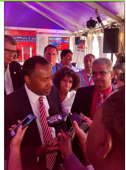
Dr. Ben Carson in Cleveland during RNC week