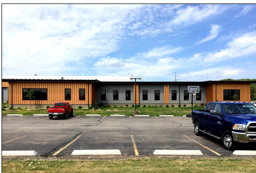
Exterior of Bendon's expansion

Brad Carrabine, Marketing Designer, explained that Bendon's quick growth eventually led to limitations on space. When Brad started with the company in 2010, it employed approximately 30-40 people. Now, it employs over 100 in the Ashland location alone and has opened two other locations, one in Franklin, TN and San Francisco. The flagship location remains in Ashland. The expanded building hosts an open-floor art department with executive offices on the perimeter. Also included are a workout room, showers, new restrooms, and a new break room. The new square footage allows room for future growth.